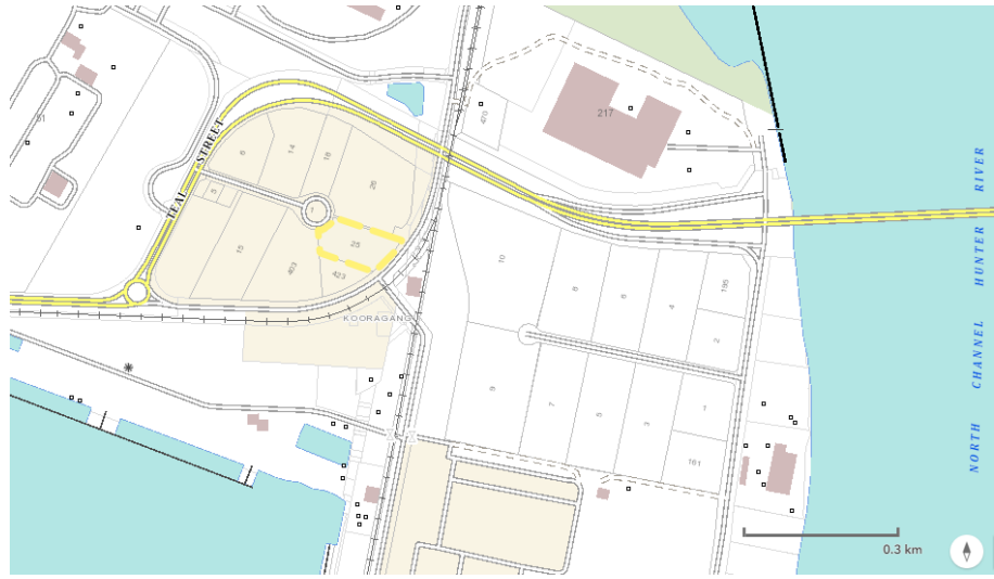
Figure 2 Site Location - Newcastle - 25 Sandpiper Close